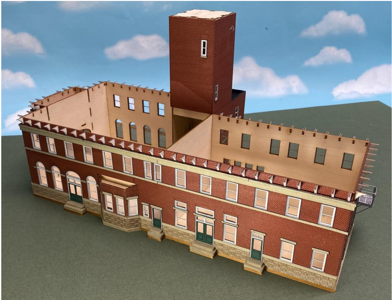
Green Bay Depot under construction

I also offer to build and paint a kit for you if you don't trust your skill level. I will use the paint colors as close to the railroad color unless you want something different. I only use rattle-can spray paints so you must specify the colors per paint number on the cans if it not my standard colors. The price for building a kit is 2.5 times the price of the kit. So a $100 kit would cost $250 total for the kit and the build.