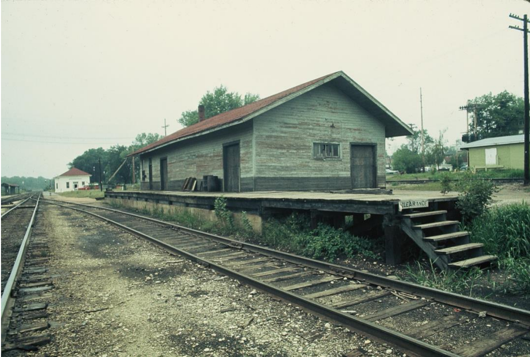
Wisconsin Dells Freight House and depot. Photo taken in the late 1970s. End freight door was moved from the front at some point. My kit is from the original plans.